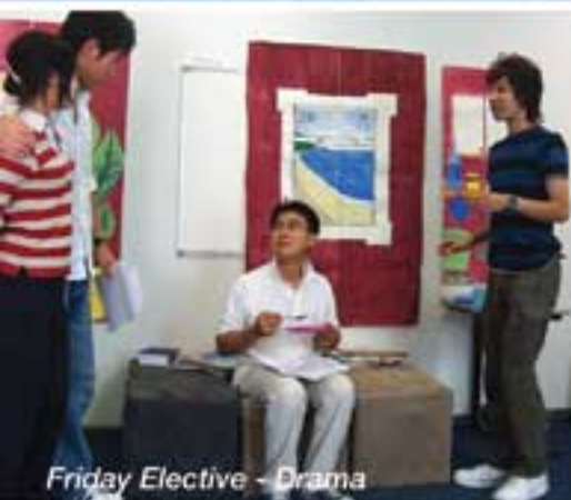
Friday Elective - Drama